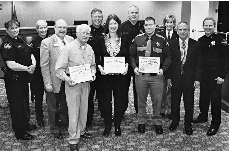
Each year King County Sheriff's Office awards individuals in five categories and this year three of the winners were selected from the Shoreline Police Department.

The 2006 Shoreline Police Department SEA report is available online at www.cityofshoreline.com . For more information about Shoreline Police or department programs, call (206) 546-6730.