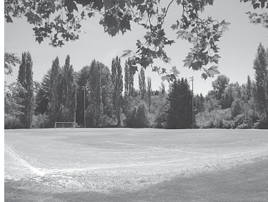
Twin Ponds soccer field on 1st Avenue NE will have new synthetic turf installed.

Kruckeberg Botanic Garden and appraisals and purchase and sales agreements will be complete within the next few months.