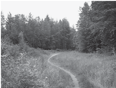
The Seattle Public Utilities property north of Hamlin Park off 15th Avenue NE is one open space area the City is buying as part of the Park Bond.

The City has purchased the School District's portion of the South Woods and expects to close on the rest of the property which is owned by the Shoreline Water District this month. City staff are negotiating with the owners of the Seattle Public Utilities property north of Hamlin Park and the